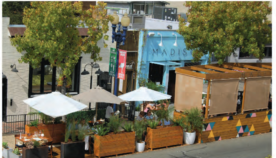
Madison on Park parklet