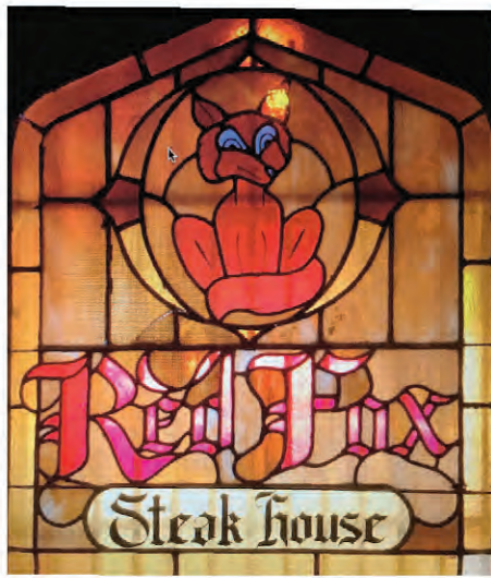
The Red Fox's signature stained-glass

This past March, when the county and much of the nation was shut-