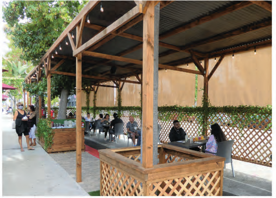
Parkhouse Eatery parklet