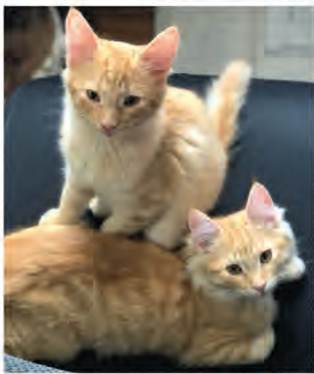
Ziggy and Itty

As we all know in UH, our canyons are teeming with wildlife: coyotes, foxes, rabbits, possums, raccoons, and many others. For the most part, we leave those critters alone to live and thrive as best they can on their own. A recent trend,