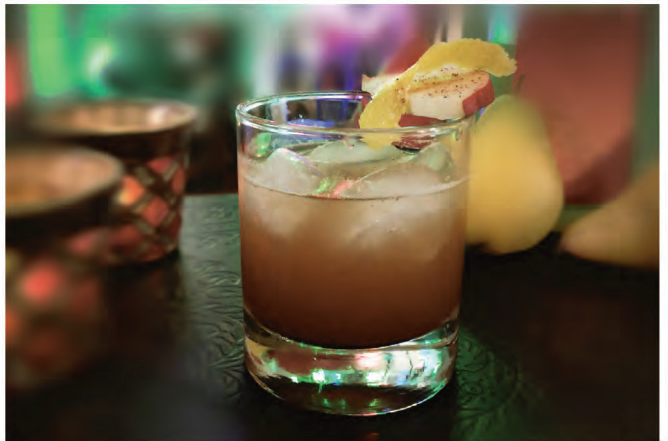
Spiced Honey Pear Sipper