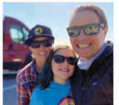
The Dana girls