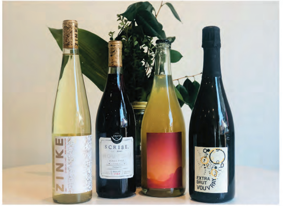
Low intervention wines at Clos Wine Shop