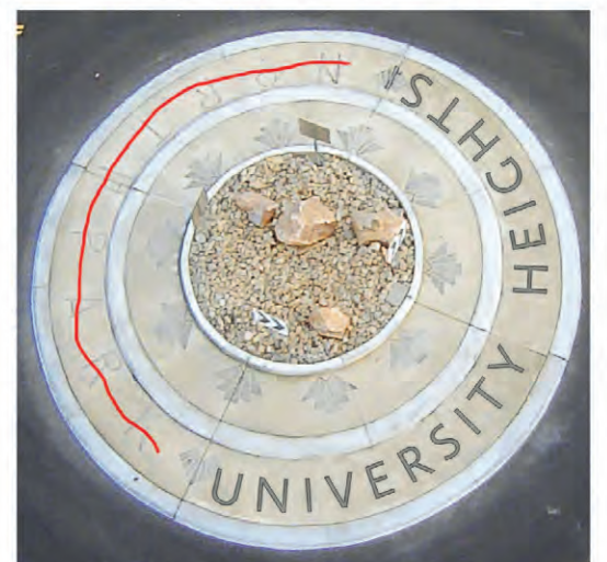
The roundabout at Meade and Alabama