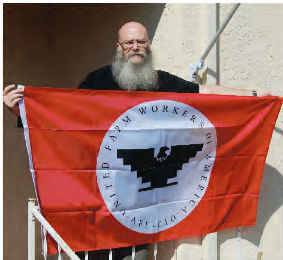
The United Farm Workers Flag